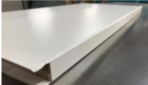
Remove the protective film