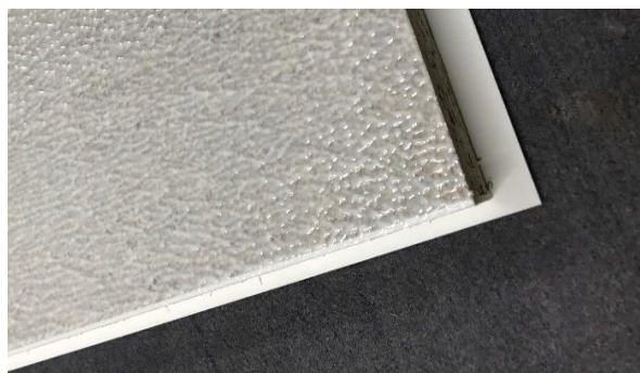
Full surface glue application