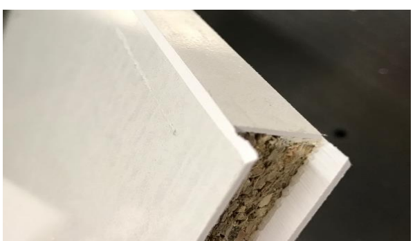
After the cutting/milling process